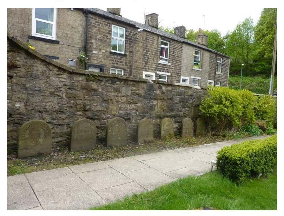
Figure 4. Reset marker stones in the burial ground

The attached burial ground is enclosed by a stone wall with flat copings, probably rebuilt in the twentieth century. A number of headstones have been moved and ranged along the inner sides of the boundary wall. The area was extended in 1823 and in 1875; an indication of the original arrangement is shown in figure 1. A list of interments is held at the Lancashire Record Office, with an approximate date range of 1728 to the 1980s.