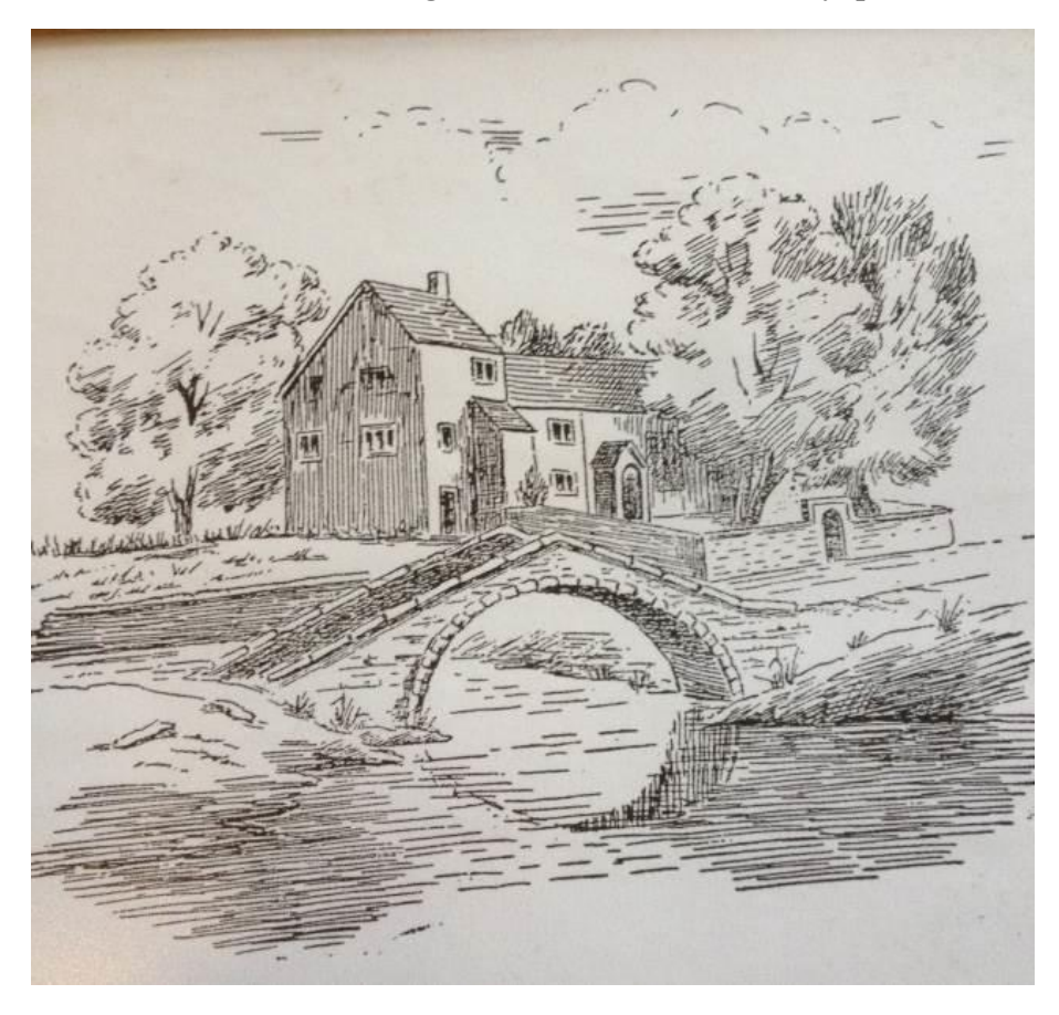
Figure 1. Illustration based on an engraving of 1798 (Crawshawbooth Meeting)

room, now absorbed into the dwelling house, above a stable. External steps up to the house survive. In 1722 John Birtwhistle gave £20 to be invested to provide hay for the Friends' horses and to provide for repairs, later supplemented by more gifts from others. In 1736 the building was extended when a new meeting house was added to the east side of the building. This is probably the date of the surviving gallery and fixed furnishings. Records suggest that an upper floor was added to the old meeting house in 1793, when it was used as a school. The area around the building was being used as a burial ground from 1728, extended in 1823 and in 1875, though the burial ground at Chapel Hill remained in use until 1847. Lancashire Records Office holds a transaction dated 1785 relating to the meeting house and transfer of land from Richard Ecroyd to Henry Marriot. Both figures appear in the record as Quakers who were associated with other meetings in the Pendle area (Sawley qv).