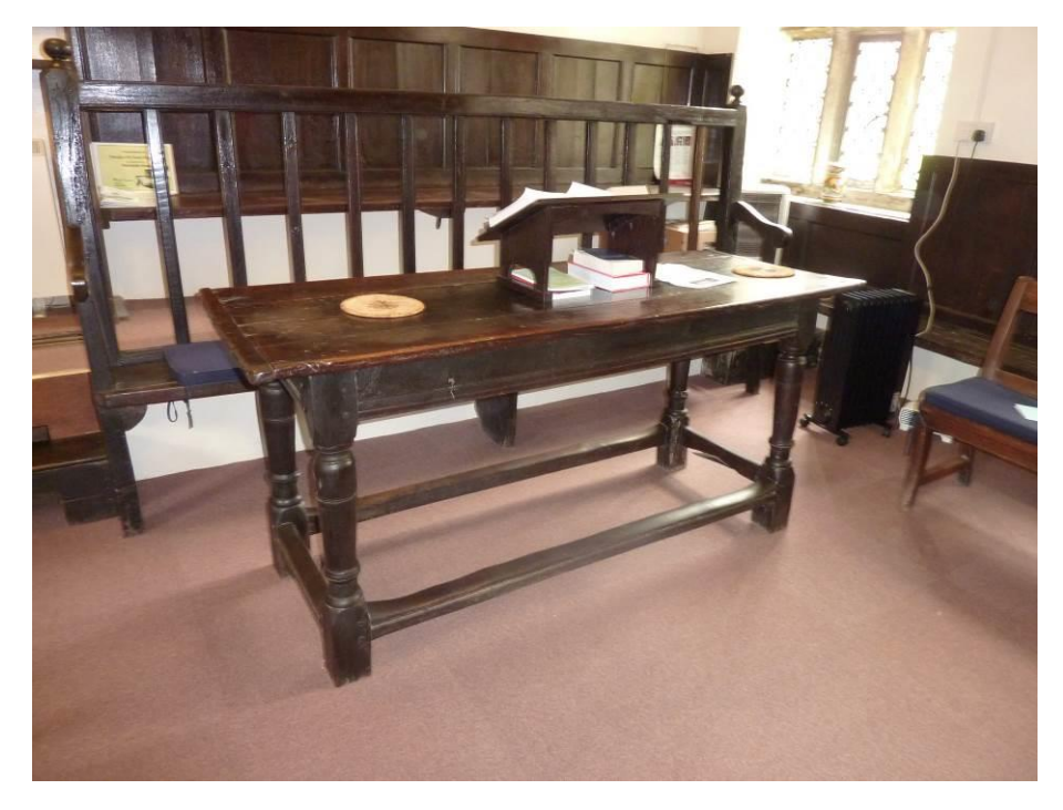
Figure 3. The seventeenth-century table

There is a large free-standing table of simple construction with turned legs which is reputed to be of early seventeenth century date, however it may be somewhat later in date. A sturdy rustic chair of similar date is said to have belonged to or been used by George Fox. These furnishings are of high intrinsic interest and seem to have been associated with the building for a considerable period, possibly since the inception of the meeting house. In addition there are a number of free standing benches of oak which are probably of nineteenth or early twentieth century date, a probably earlier bench in the smaller room, and a number of painted chairs of differing designs and dates, probably including nineteenth century examples. There is also a large cupboard, possibly of early nineteenth century date, in the gallery.